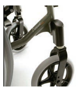
Magnesium castor attachment.