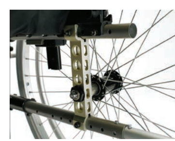
20 rear wheel positions.