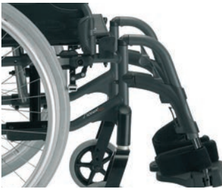
Brake and Brake extension. Fold the brakehandle for easier side transfers.