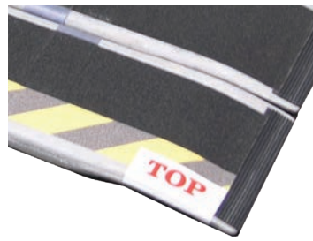
Marked 'TOP' to show head of ramp, grip tape, pads at both ends.