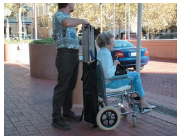
Carry bag for Personal and Multipurpose models.