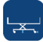
Under bed clearance ▼