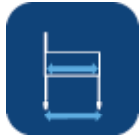
Width outside Width inside ▼

For more comprehensive pre-sales information about the NordBed Kid, including the product's user manual, please see your local Invacare website.