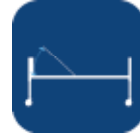
Backrest angle ▼