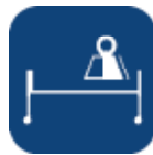
Max. user weight ▼