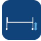
Height adjustment ▼