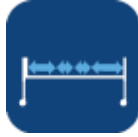
Mattress support dimensions ▼