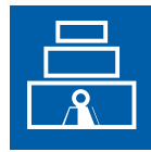
Heaviest part of the product ▼