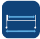
Length outside Length inside ▼