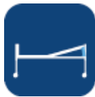
Legrest lift ▼