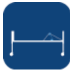
Thigh angle ▼