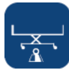
Total weight (without bed ends) ▼