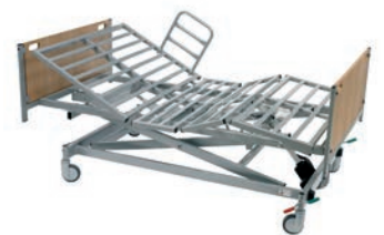
Designed to fit the Octave bariatric bed.