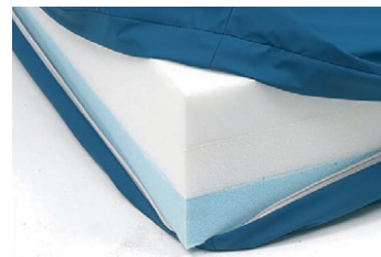
Discretely zippered on three sides with cloth covering.