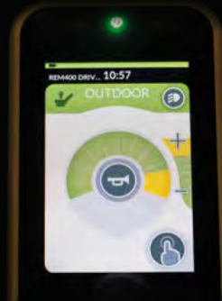
Tap operation – Right hand use