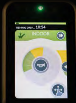
Swipe operation – Right hand use