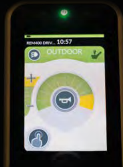
Tap operation – Left hand use